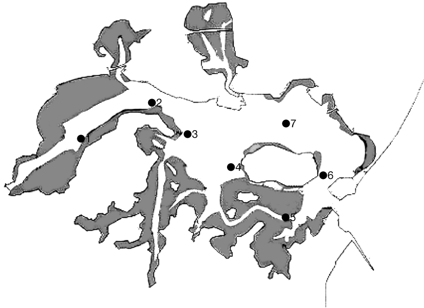
Figure 1 Sampling sites. Station 1: Wareham Channel (Buoy 84); Station 2: Wareham Channel (Buoy 74); Stations 3 and 4: Upper Wych Channel (Shipstal Point and Ramhorn Lake); Station 5: South Deep (between Furzey and Green Island, No. 13); Station 6: South Deep (Buoy 42); Station 7: Diver Middle Channel (Diver 51).

to achieve a structure which showed a degree of self-organization and predictability. This had a certain degree of independence from the physical environmental variables.